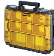
WATERSEALED ORGANISER DWST82968-1 7.8L Removable Cups 440 x 332 x 119 mm