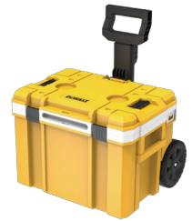
MOBILE COOLER DWST83281-1 28.4L 516 x 433 x 632 mm Handle Up