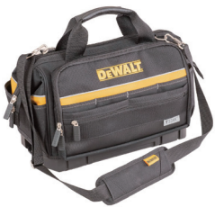
SOFT BAG DWST82991-1 1200D 23L 450 x 250 x 300 mm