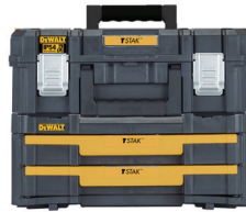
COMBO KIT - II PLUS IV DWST83395-1 18.8L 440 x 332 x 325 mm