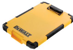
CLIPBOARD DWST82732-1 Internal Soft Pouch 415 x 35 x 285 mm