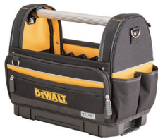
SOFT TOTE DWST82990-1 1200D 18L 450 x 250 x 350 mm