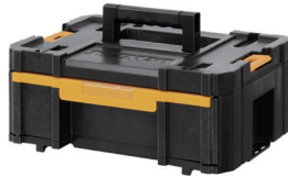
III - DEEP DRAWER UNIT DWST1-70705 9.1L 430 x 315 x 180 mm