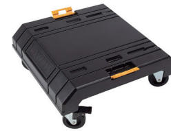
CART DWST1-71229 Wheeled 181 x 486 x 436 mm