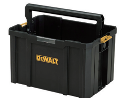
VIII TOTE DWST1-71228 26.5L Stackable 320 x 275 x 440 mm