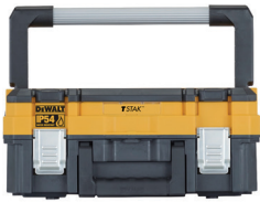
SHALLOW BOX LONG HANDLE DWST83344-1 11L 440 x 333 x 183 mm